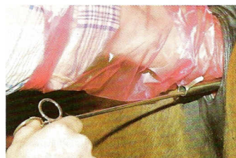
Fig 2. Endometrial biopsy collected via stainless steel tube speculum. The biopsy is the golden standard, the sensitivity of the

same endometrial biopsy can with this method, be used for bacteriological, cytological and histological examination. The biopsy is first smeared on to an agar for bacteriological examination with a sterile pair of pincers. Then it is smeared on a slide glass for cytological examination, before it is fixed in 5% formaldehyde for potential histological examination.